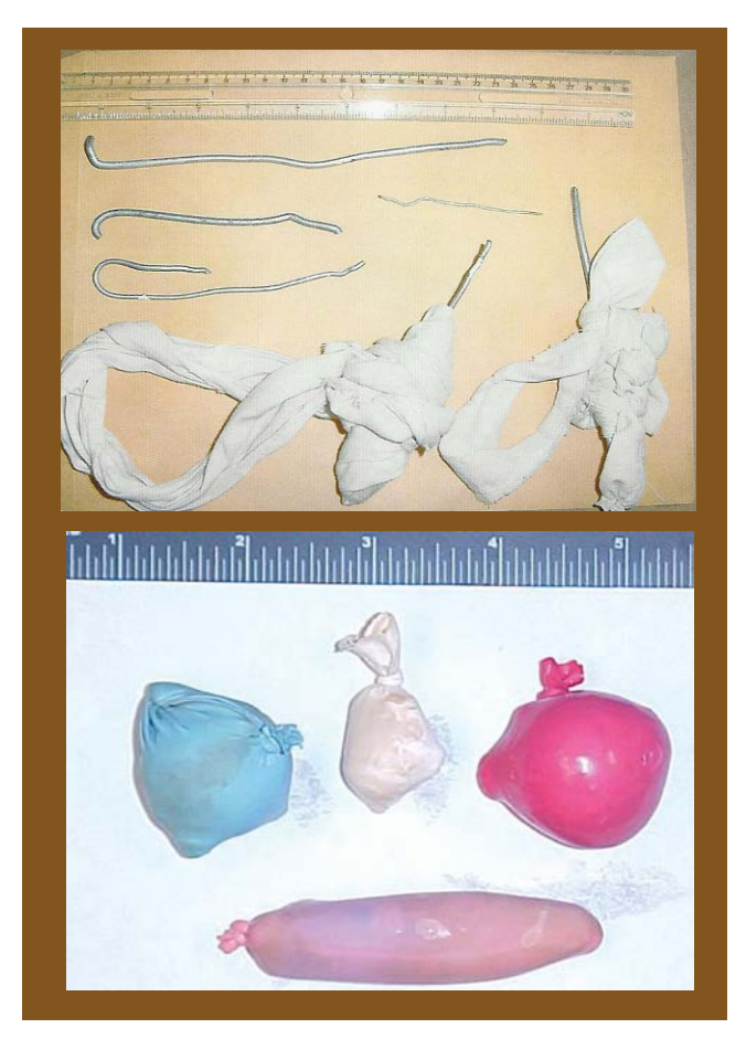
Top: Shanks made from a mophead holder were discovered through the shakedown of a housing unit. Bottom: Balloons containing cocaine, heroin, marijuana and a syringe kit were swallowed and smuggled in.

Nothing is what it seems when it comes to preventing contraband. For example, a regular-sized toothbrush could be sharpened into a lethal weapon or fashioned to hold a razor blade stolen from an issued shaving razor. To avoid such situations, Pima County issues thumb toothbrushes. These are small and made specifically for correctional institutions. Razor control is imperative. Inmates must shave within an hour of issue and return the razor to the officer for inspection. Razors are then removed from the housing unit to prevent inmates from getting razors from the sharps container or officer's desk. In addition, the pens inmates